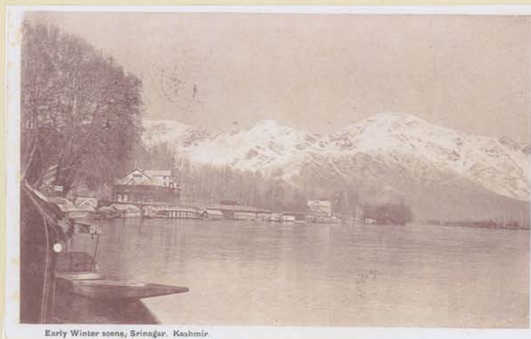
Early Winter scene, Srinagar, Kashmir.