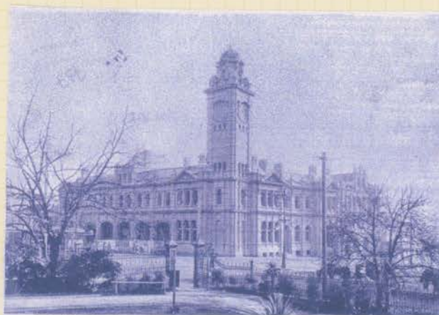
General Post Office, Hobart, Tasmania.